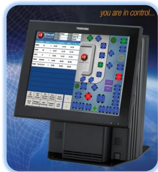
Table Service Point of Sale

VisualTouch provides the tools your senior living community needs to handle resident reservations, seating, ordering, and delivery with ease. You will be able to impress your residents with a fine dining experience that includes personalized service.